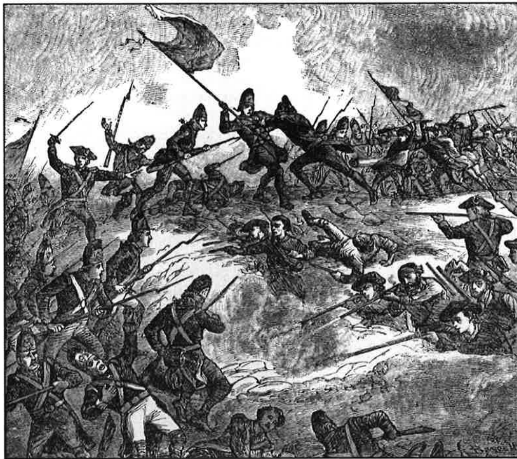
Four Centuries of Progress, International Publishing Co., 1893